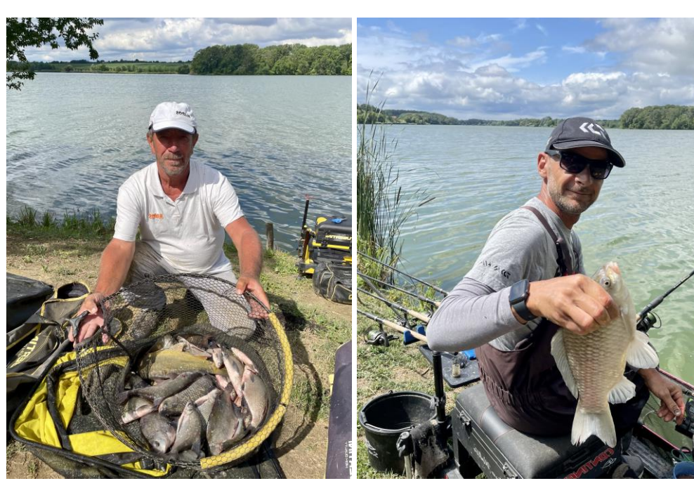
The main fishing techniques: Roubaisienne and telescopic rod, waggler fishing

The main fish species to be caught are: Bream, skimmer, roach, bleak, carp, grass carp, crucian carp, rudd, tench